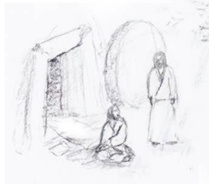
“Woman, why are you weeping?” (John 20:13)